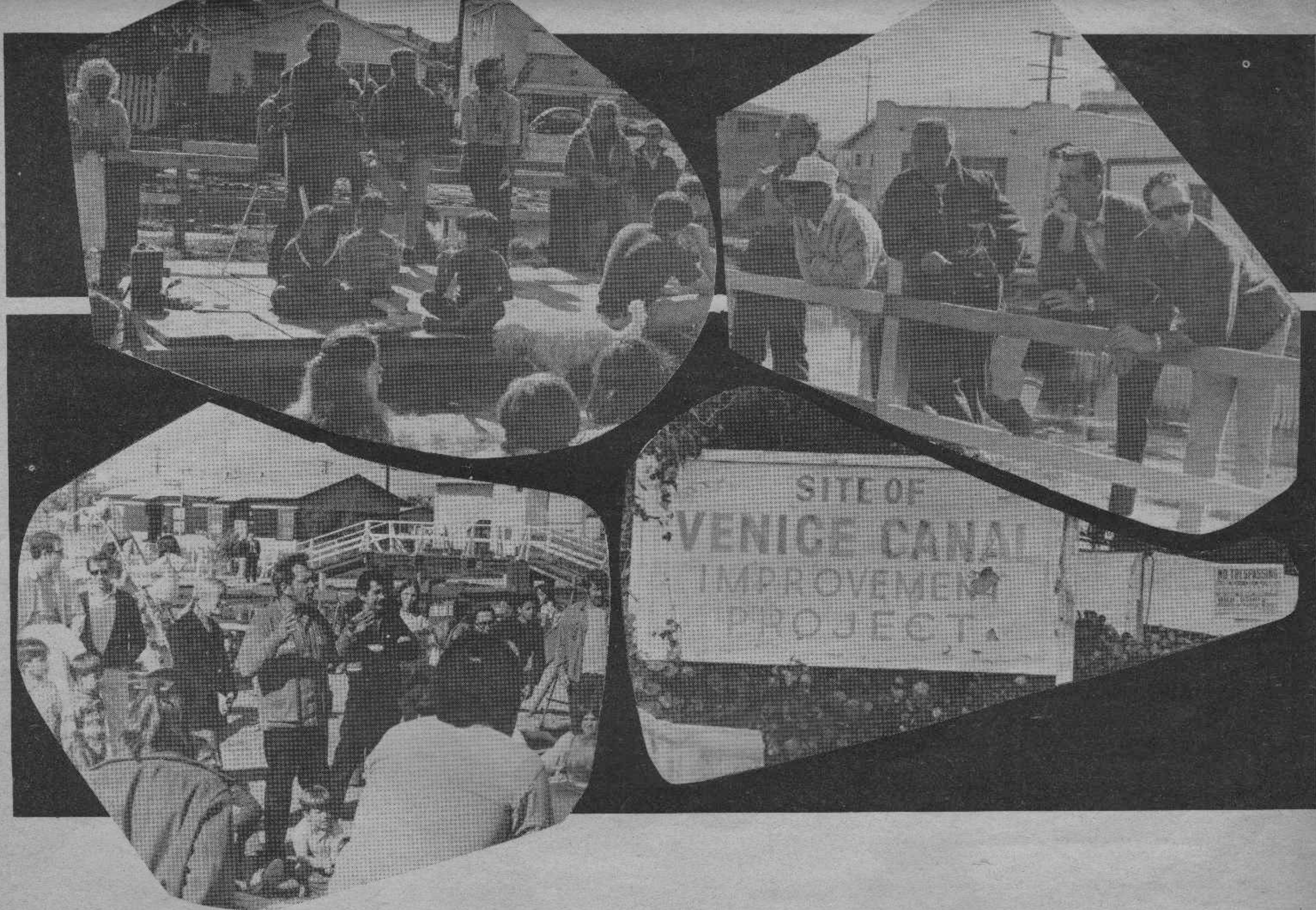
About 100 Venice canal area residents gathered on March 2 to discuss their pending dislocation. The Canal Emergency Action Committee will present the L.A. City Council on March 27 with an alternative proposal for restoring the canals without uprooting the present residents.